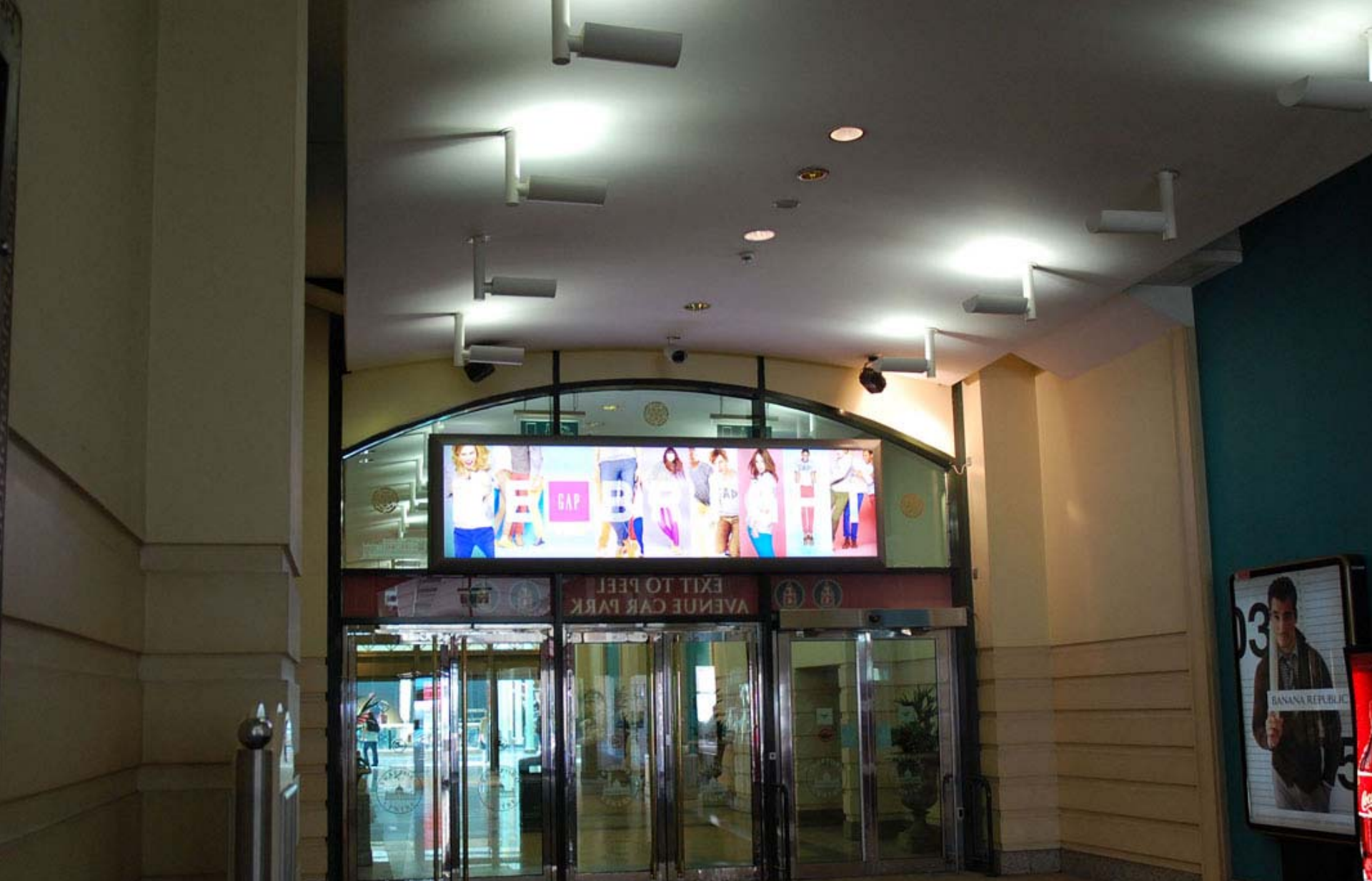
7505 - Selfridges south – facing people entering the centre