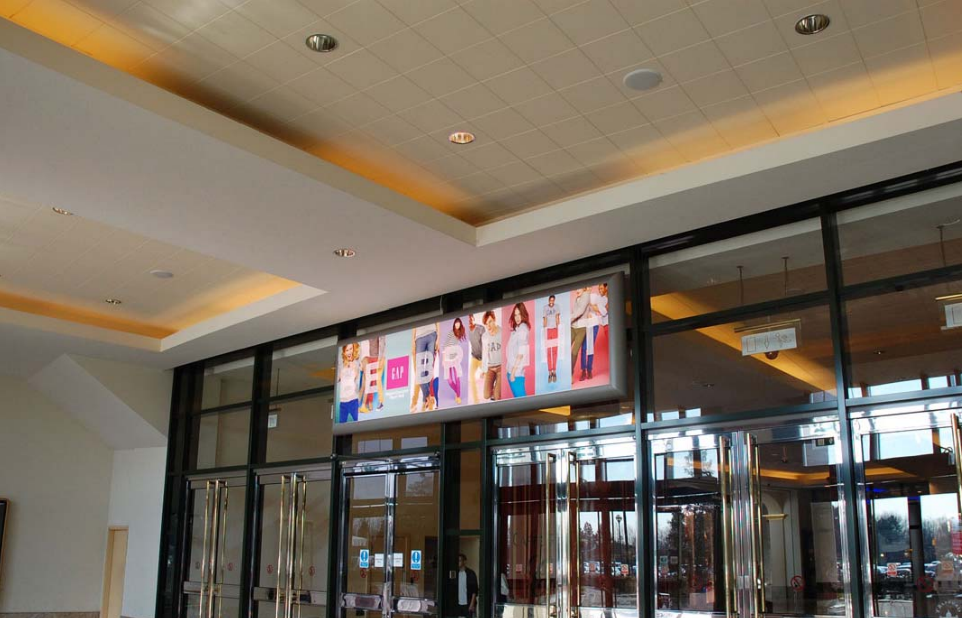
7508 - Entrance to The Great Hall from car park – Nandos side