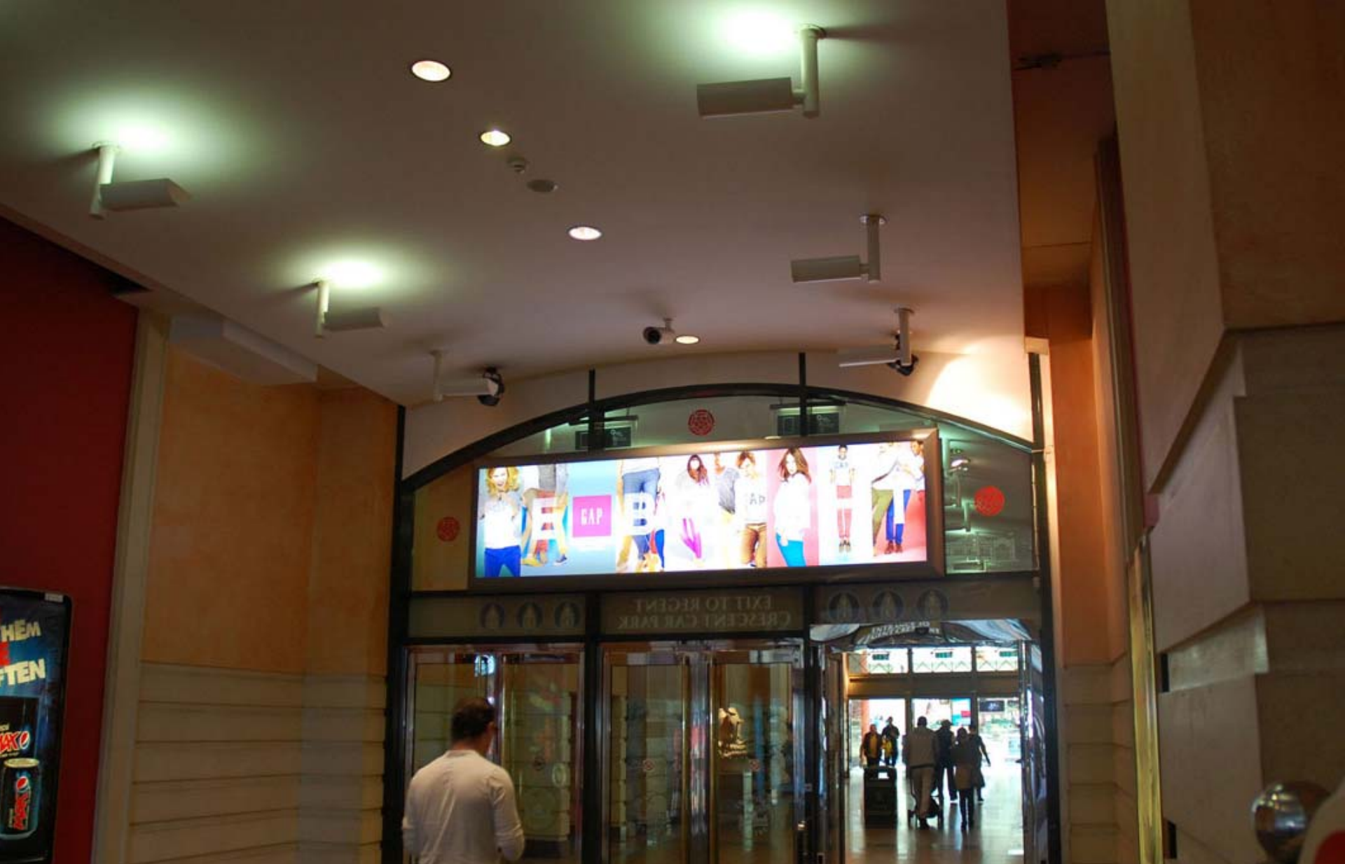
7503 - Selfridges north – facing people entering the centre