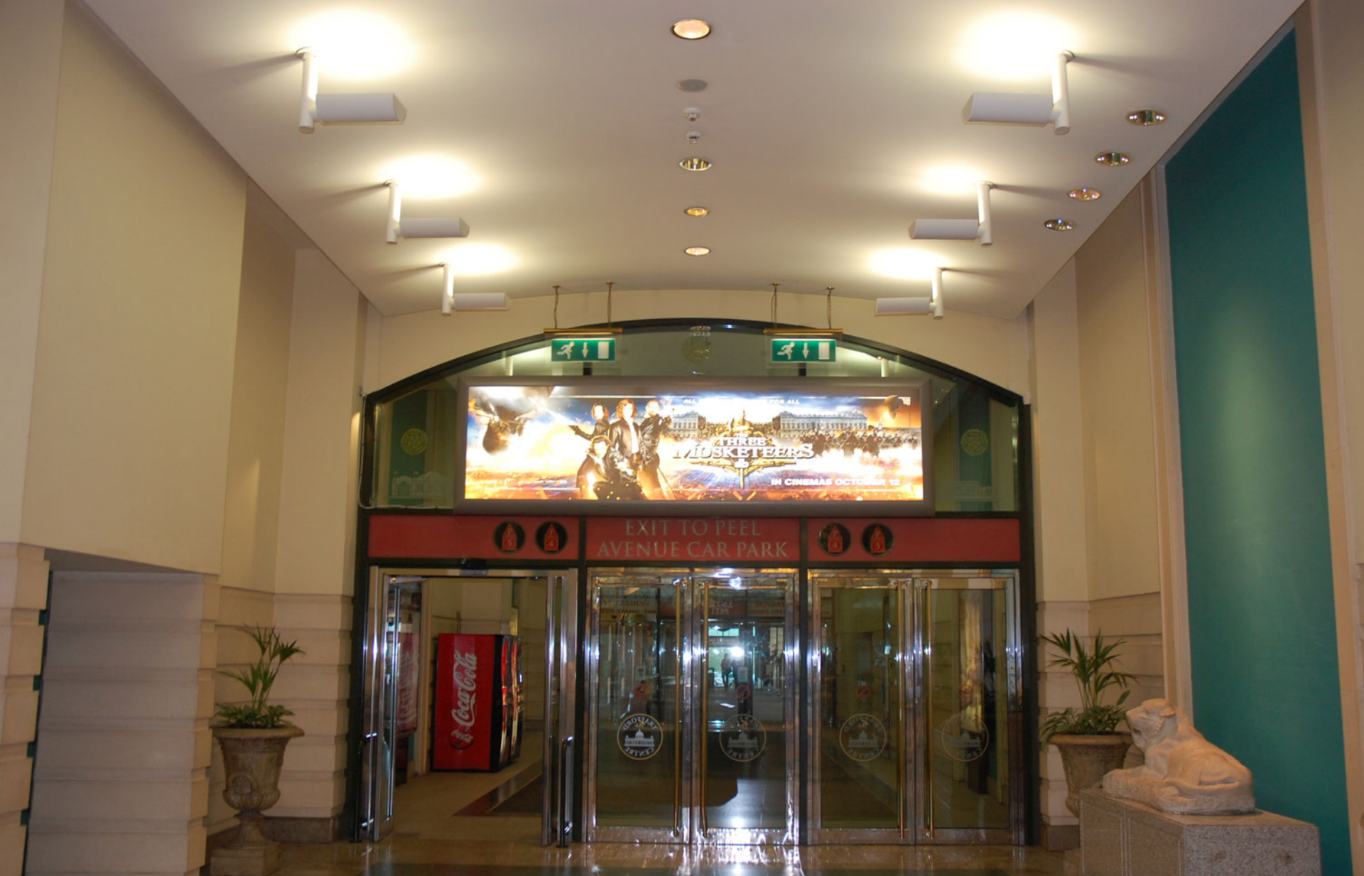
7504 - Selfridges south – facing people leaving the centre