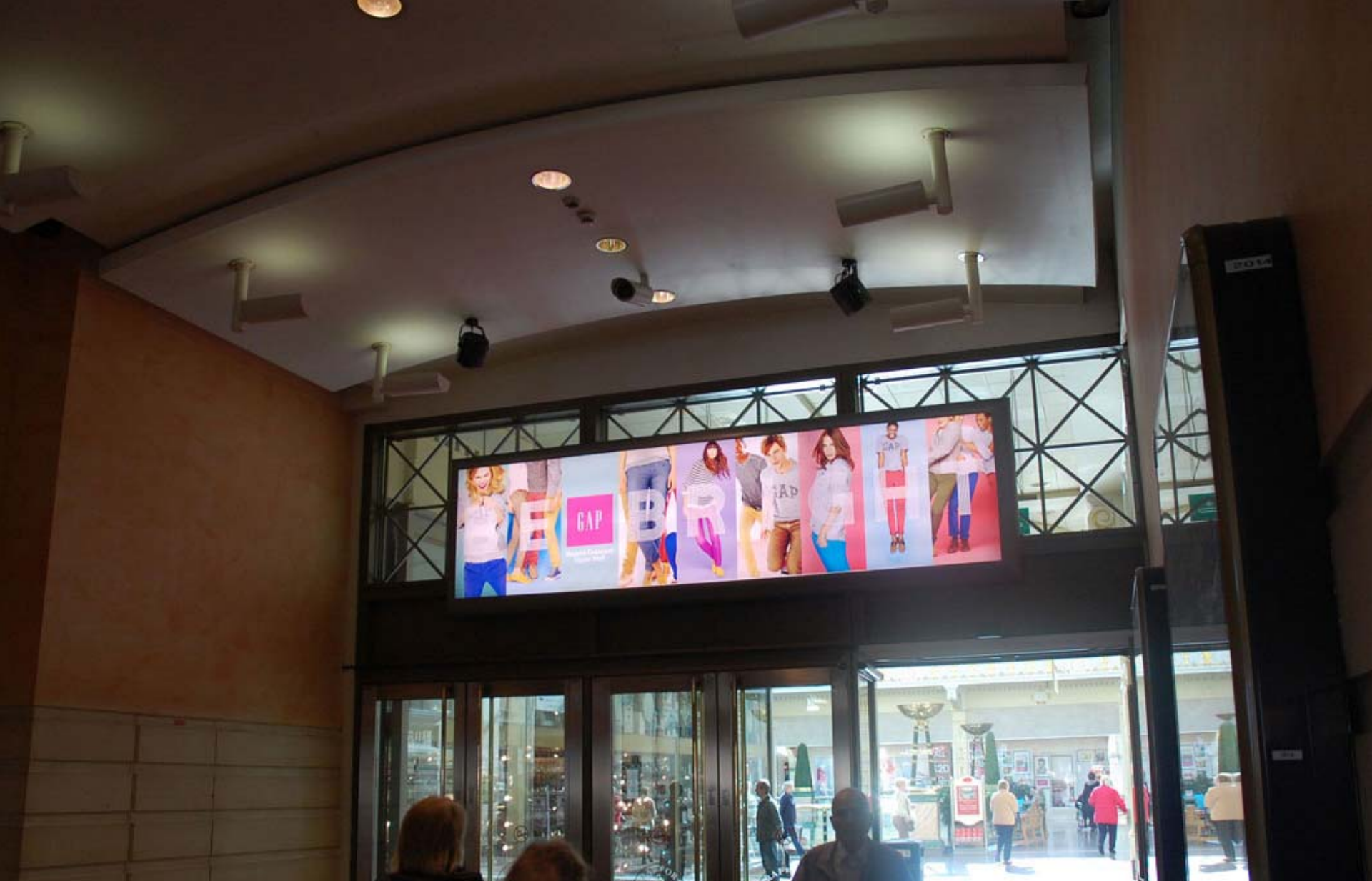
7501 - Exit near Debenhams – facing people entering the centre