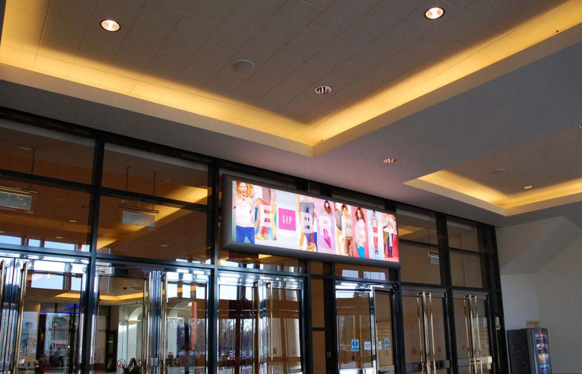
7509 - Entrance to The Great Hall from car park – Namco Station side