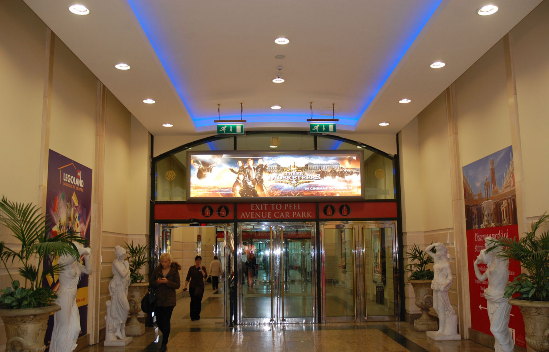
7506 - Boots – facing people leaving the centre towards Barton Square