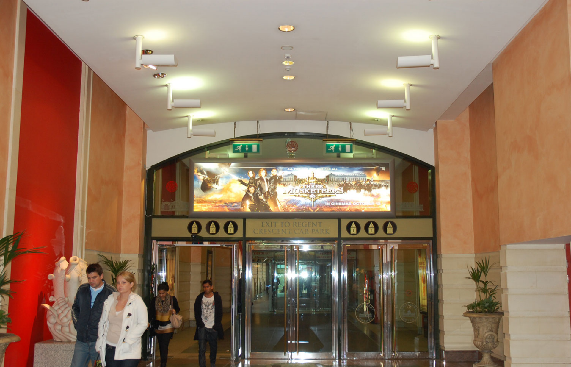
7502 - Selfridges north – facing people leaving the centre