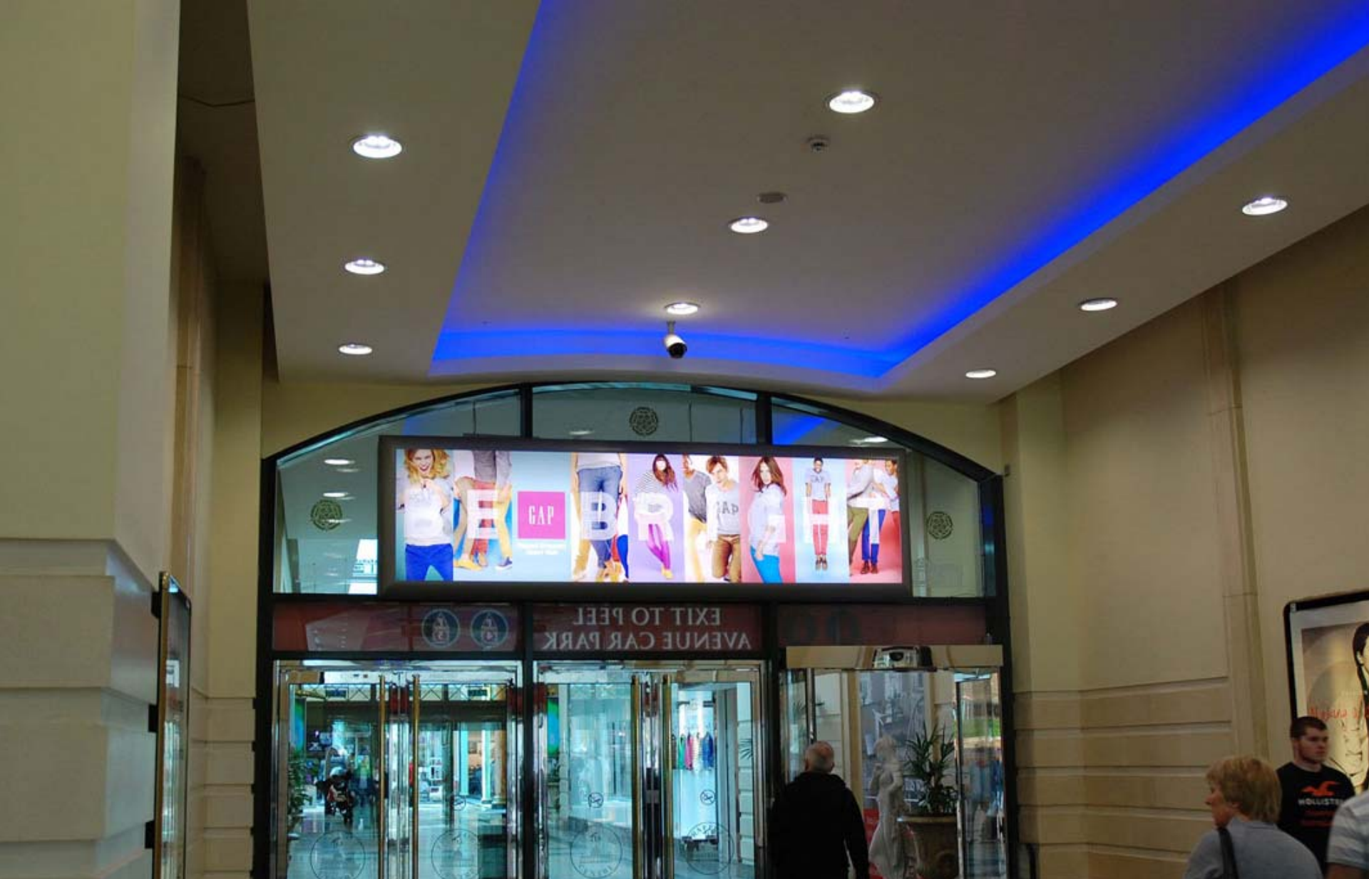
7507 - Boots – facing people entering the centre from car park & Barton Square