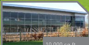
10,000 sq.ft. Speculative Office Development