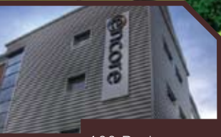
100 Bed Ramada Encore Hotel