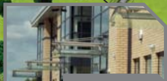
50,000 sq.ft. Business Homes